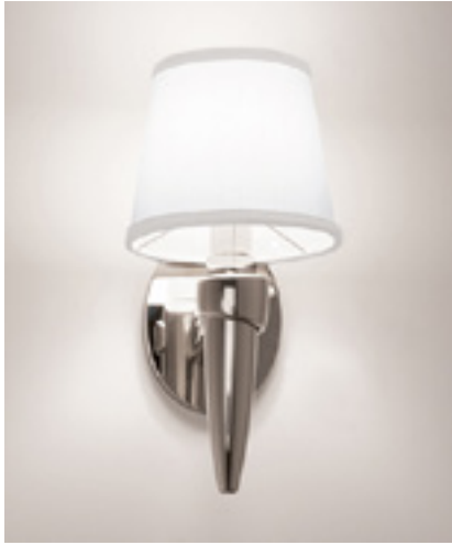
LIBERTY SCONCE C10160PN

Polished Nickel Incandescent or LED Screw-in; 60w max QTY Available: 87 Lead Time: 1-2 weeks