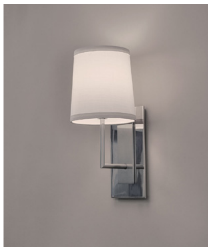
BELMONT SCONCE C10028NK

Nickel Combo (Polished and Satin) Incandescent; 60w max QTY Available: 60 Lead Time: 1-2 weeks