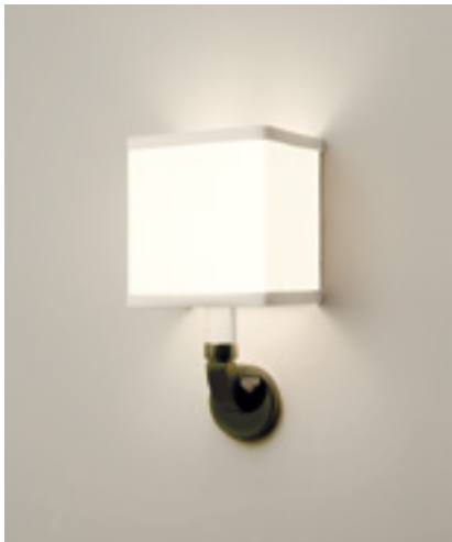
MONTREUX SCONCE C10180ABB

Antiqued Boyd Brass Incandescent or Fluorescent; 40w max QTY Available: 143 Lead Time: 1-2 weeks