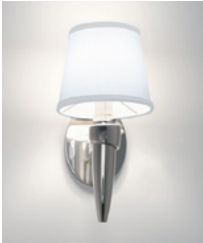
LIBERTY SCONCE C10160SN

Satin Nickel Incandescent or LED Screw-in; 60w max QTY Available: 89 Lead Time: 1-2 weeks