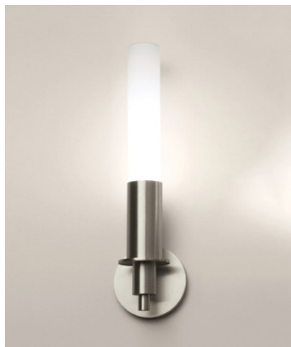
MERCURY I C9982SN

Satin Nickel Xenon; 20w max QTY Available: 35 Lead Time: 2 weeks