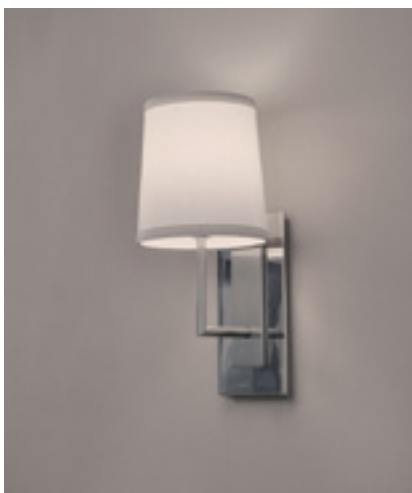
BELMONT SCONCE C10028NK

Nickel Combo (Polished and Satin) Incandescent; 60w max QTY Available: 102 Lead Time: 1-2 weeks