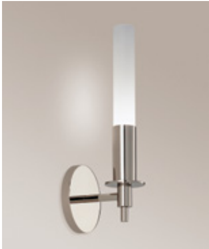
MERCURY I C9982PN

Lead times applicable for quantities of 10 or fewer. Contact Client Services for larger quantities. Note 'QUICKSHIP' on orders or standard lead times will apply.