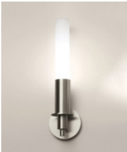
MERCURY I C9982SN

Satin Nickel Xenon; 20w max QTY Available: 70 Lead Time: 2 weeks