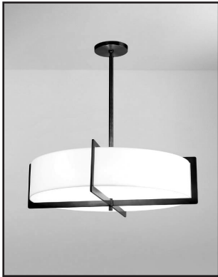
10118 Crisscross Pendant