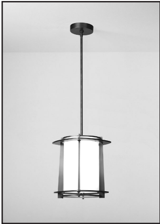
10125 Premier, Lantern